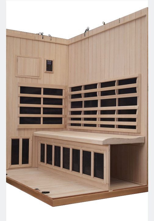
Actual Assembly - Clearlight Sanctuary 3

For more information: infraredsauna.com (800) 798-1779