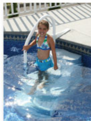
Duke step shown in White Granite