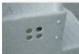
Port holes allow water to circulate through staircase.