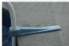
Resin flange secures step to deck.