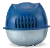
FROG® @ease® FLOATING SYSTEM